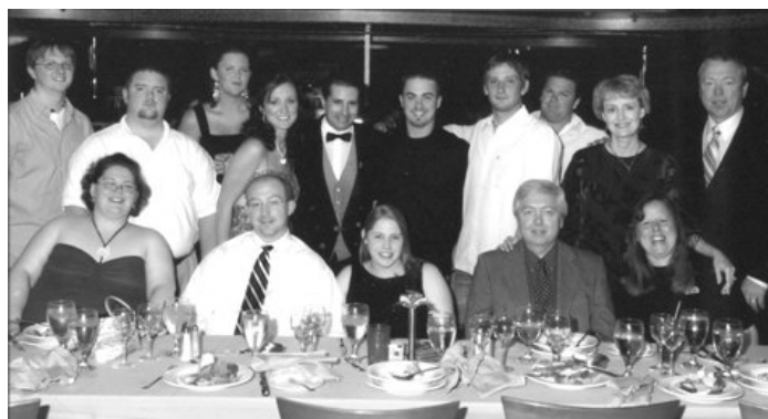
The MSU group at dinner on the Carnival Victory

At Puerto Rico, over 12,000 passengers from five cruise ships flooded the port in one evening. After six hours in port, all the passengers returned to their ships, and all five ships departed in the same hour. It was fascinating to observe five of the largest ships in the world leaving port, one after another. These are huge ships; the Freedom of the Seas , which was the largest,