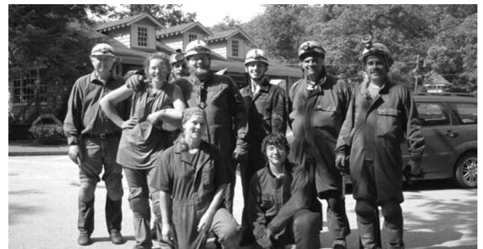
How to have a really good time: Cavers soaked to the skin and covered with mud after exiting Bat Cave

An active schedule is planned for 2008, including a return trip to continue mapping Slacks Cave, and possibly a weekend trip to the Mammoth Cave area.