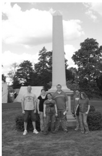
The History Club on an outing to the Perryville battlefield reenactment.

The evening event was successful; over twenty students and faculty came out for the event. The activities helped raise awareness to the records held within the library, and sparked interest in the history of the university.