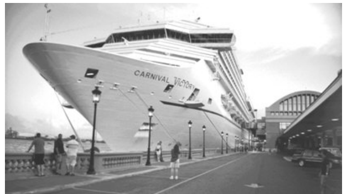
The Carnival Victory in the port of San Juan

This was a great opportunity for MSU students to travel outside the United States and experience other peoples and places. The cruise package provided for the necessities of lodging, transportation, and all the food you could eat, which was ideal for student travel. By the time the trip was over the students possessed a greater understanding of the tourism dynamics in the Caribbean and of how the cruise industry impacts the people, the economy, and the natural environment. In the end, some students felt the real "Pirates of the Caribbean" were the cruise ships.